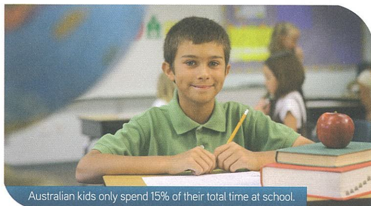
Australian kids only spend 15% of their total time at school.

Australian kids only spend 15% of their total time at school. They spend more time asleep than they do at school. So we need to maximise every day to get full value. That means turning up to school every day, on time.